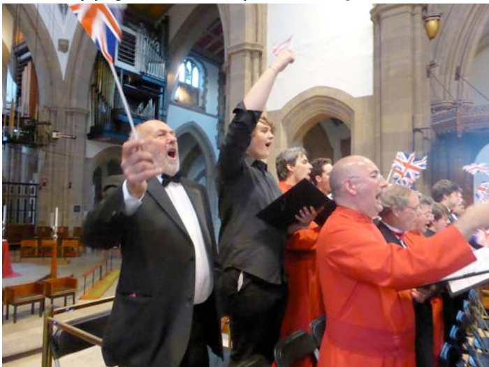
Land of Hope and Glory!