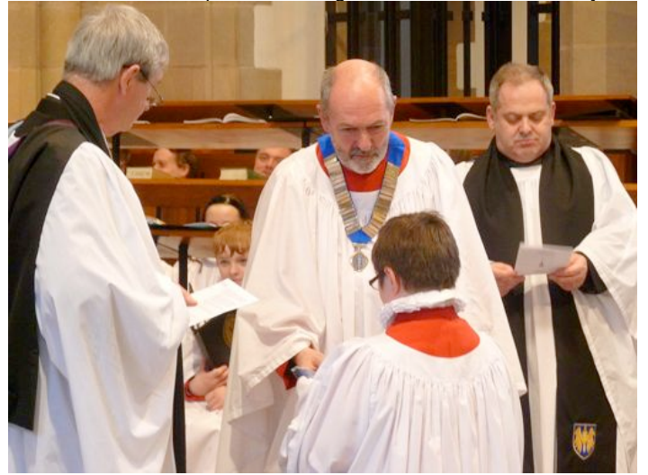
BBCTV Songs of Praise, 20 March 2011